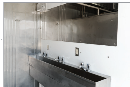
View of the sinks and mirrors