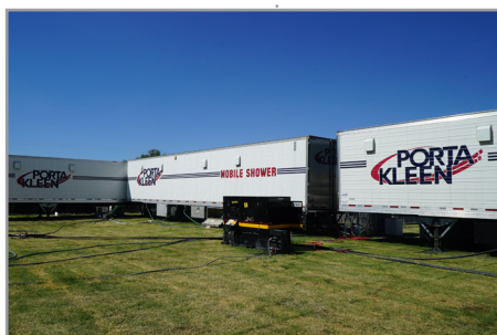
The 16-Stall Shower Trailer on location

Porta Klean's 16-Stall Mobile Shower Trailer has raised the standard for mobile showering. Featuring amenities like private stalls, sinks, mirrors, and temperature controlled interiors, these trailers provide the next best thing to home.