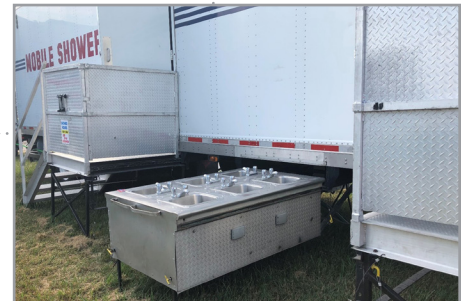
View of the exterior sinks