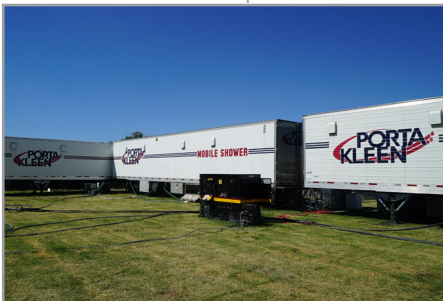
The 16-Stall Shower Trailer on location

Porta Kleen's 16-Stall Mobile Shower Trailer has raised the standard for mobile showering. Featuring amenities like private stalls, sinks, mirrors, and temperature controlled interiors, these trailers provide the next best thing to home.