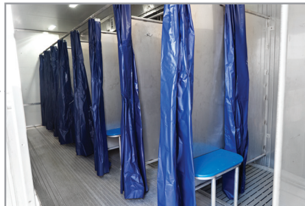
View of the showers and benches