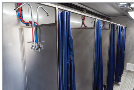
View of the shower area