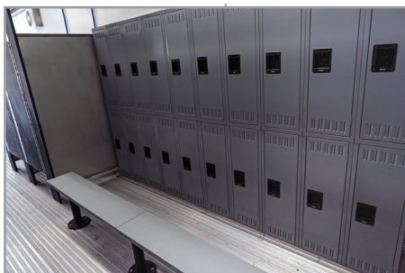
View of the 48 half-locker layout

Constructed from durable stainless steel, the Porta Kleen Mobile Locker Room provides a vast array of options within a spacious interior. Featuring eight or twelve private showers, lockers, sinks, and flushing toilets, your guests will experience the next best thing to home.