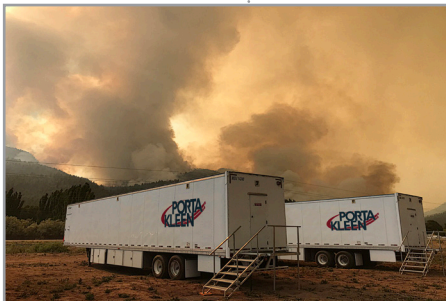
Exterior view of a unit on site