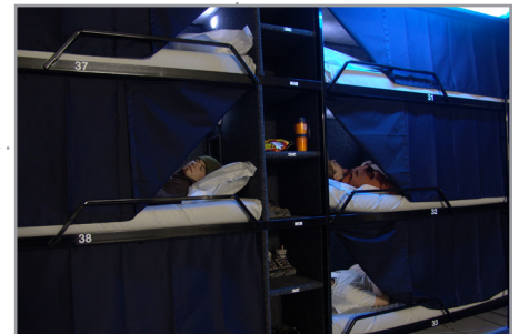
Interior view of the bunks