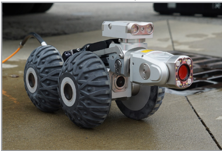
Wheel option for larger pipes