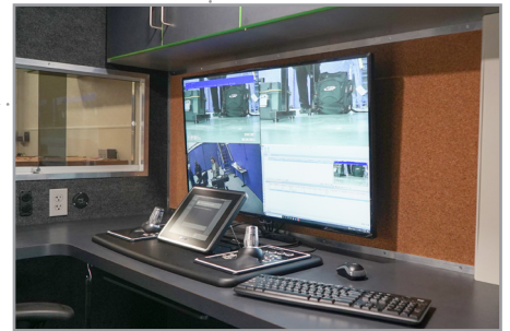
Command station monitors