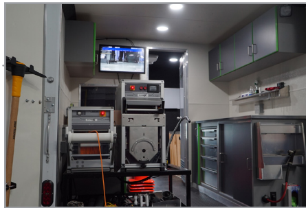
Interior of camera trailer