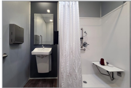
Interior view of sink and shower