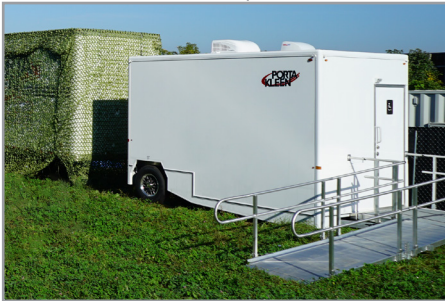
ADA Single Station Trailer on site

Porta Kleen's ADA Single Station Trailer provides a comfortable shower experience for all individuals as well as a restroom. Equipped with an ADA accessible entry ramp and amenities, this trailer will be a welcome addition to any job site or event.