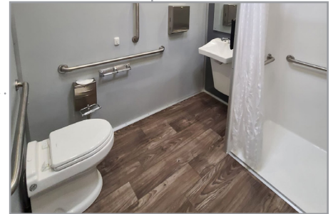
Interior view of the flushable toilet