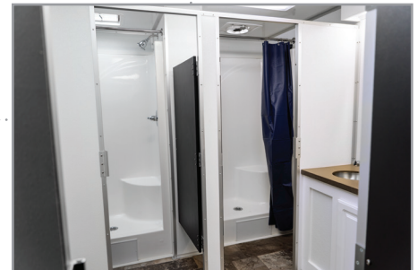
View of the showers