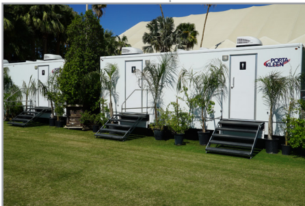
8-Stall Shower Trailers on location

Porta Kleen's 8-Stall Mobile Shower Trailer is a luxurious and spacious option for any event or job. With two private sides and a modern interior, your guests will appreciate the comfort and convenience of these units.