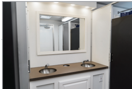
View of the two sink vanity