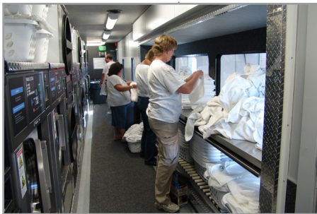
View of the folding area in use

The 53-foot Laundry Trailer combines convenience and modern equipment into a sleek, mobile solution. Each trailer is equipped with 10 stacked (20 total) commercial-grade washers and dryers with folding and storage shelving.