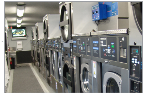
View of the interior