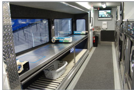
View of the interior