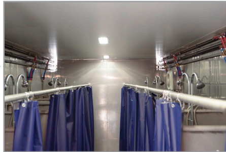
14 private shower stalls per side