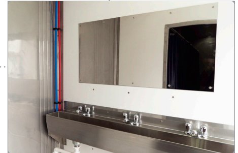
3 stainless steel sinks and mirror per side