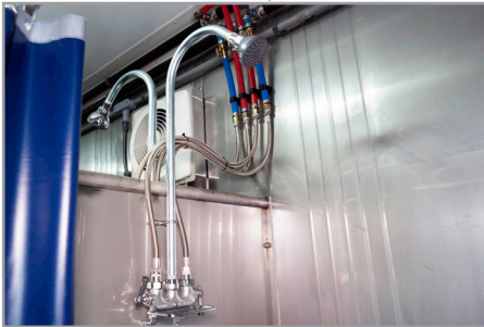
Durable stainless steel construction

Porta Kleen's 28-Stall Mobile Shower Trailer raises the standard for mobile showering. Featuring amenities like private stalls, sinks, mirrors, and temperature controlled interiors, these trailers provide the next best thing to home.