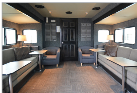
Interior view of the lounge