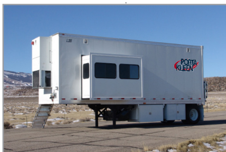
Exterior view of a unit

Our Mobile Sleeper Type 3 provides a proper on-site facility to allow up to 12 employees or guests restful sleep, while giving them the amenities of being at home. The uses for these units are unlimited! We are able to provide significant numbers of Mobile Sleeper units for disaster relief efforts, large events and contracted labor.