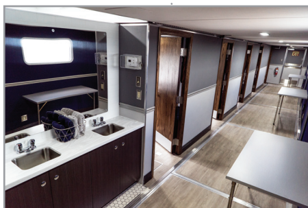
View of the bunkhouse's hallway

Keep your best assets — your employees — on-site and comfortable in Porta Kleen's Mobile Bunkhouse. Featuring numerous convenient amenities like restrooms, showers, laundry and HVAC, our Mobile Bunkhouse provides the next best thing to home at any event site.