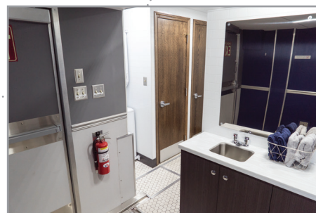
View of the bathroom, sink, and washer-dryer set