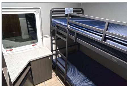
Interior view of an individual bunk room