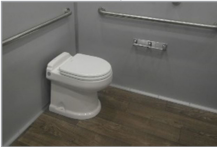
Detailed view of the electric flush toilet

Porta Kleen's ADA Single Station Trailer provides a comfortable shower experience for all individuals as well as a restroom. Equipped with an ADA accessible entry ramp and amenities, this trailer will be a welcome addition to any job site or event.