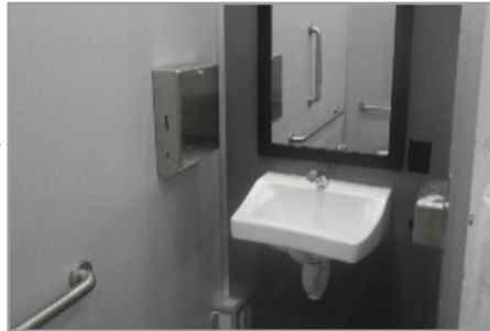
Detailed view of the ADA sink