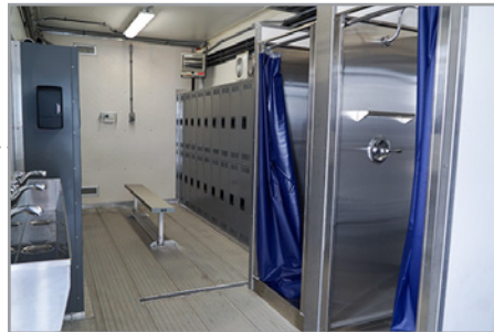
Side A Interior