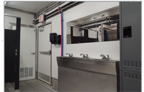
View of the sinks and mirrors