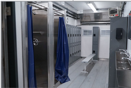
Side B Interior

Porta Kleen's Flex Locker Room Trailer offers the same great features as our traditional locker room, but with the option of creating the interior layout that is just right for you. You have the option with the flexible interior door to create a 2/2 or a 4/4 shower and restroom configuration to match your unique project requirements.