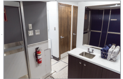
View of the bathroom, sink, and washer-dryer set