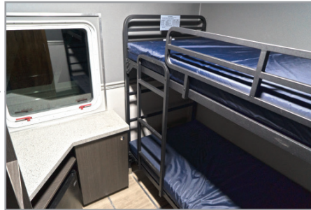
Interior view of an individual bunk room