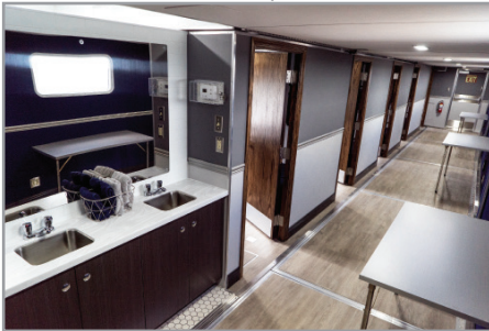
View of the bunkhouse's hallway

Keep your best assets — your employees — on-site and comfortable in Porta Kleen's Mobile Bunkhouse. Featuring numerous convenient amenities like restrooms, showers, laundry and HVAC, our Mobile Bunkhouse provides the next best thing to home at any event site.