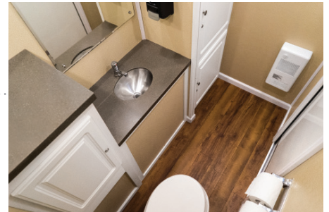
Interior view of the Women's side