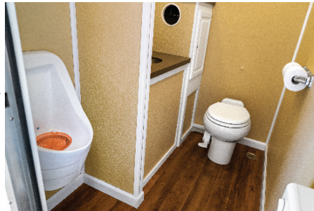
Another interior view of the Men's side