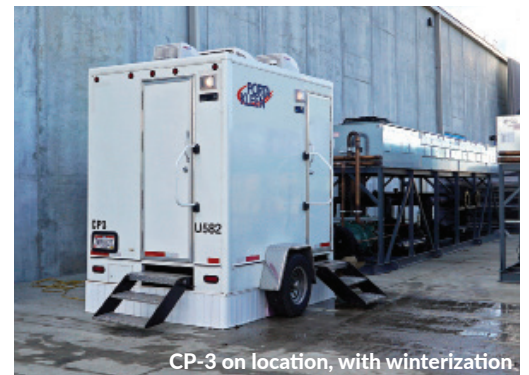
CP-3 on location, with winterization.