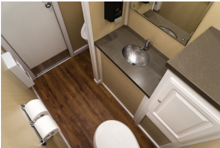
Interior view of the Men's side

When your event calls for extra comfort and reliability, Porta Kleen's CP-3 Restroom Trailer is a prime option available to you. These portable units feature two private sides and a modern interior to impress your guests.