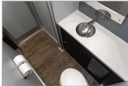
Interior view of the Women's side