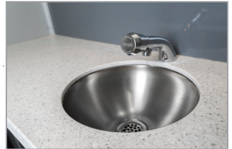
Detailed view of the chrome faucets