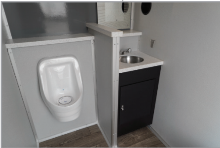
Interior view of the Men's side

Porta Kleen's CP-3 PLUS Mobile Restroom Trailer delivers deluxe amenities without sacrificing space. The unit comes equipped with three private flushing stalls, temperature controlled interiors, and modern finishes for maximum comfort.