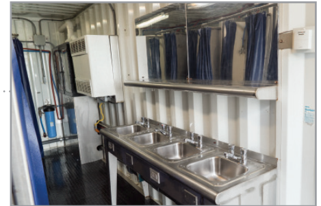
View of the sink, mirror, and GFI outlets