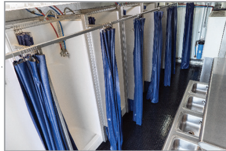
Alternate view of the sinks and showers