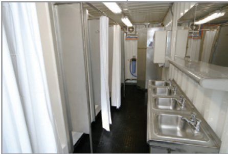
View of the sinks and showers

Porta Kleen's 20-Foot ISO Container Shower provides the flexibility and durability required for military exercises, construction sites, disaster relief operations, and long term rentals. Offering seven private shower stalls and four sinks, this trailer is able to efficiently accommodate any event.