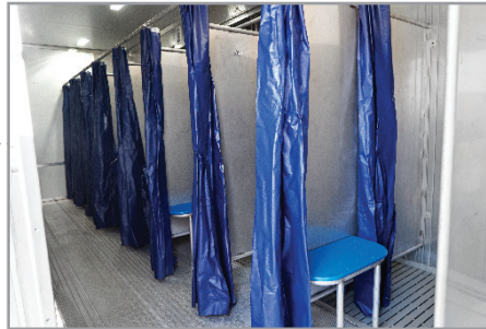
View of the showers and benches