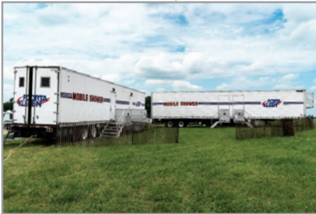
The 16-Stall Shower Trailer on location

Porta Kleen's 16-Stall Mobile Shower Trailer has raised the standard for mobile showering. Featuring amenities like private stalls, sinks, mirrors, and temperature controlled interiors, these trailers provide the next best thing to home.