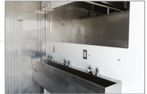
View of the sinks and mirrors*